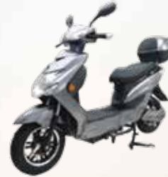
Model NO.: ES12BH6 Model NAME.: PANTHER