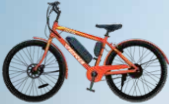
Model NO.: EB 26 AN75 Model NAME.: CREATION