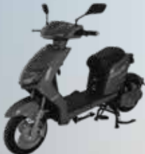
Model NO.: ES10ALY Model NAME.: AIR