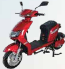
Model NO.: ES10AGT Model NAME.: AIR PLUS