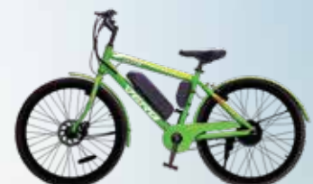
Model NO.: EB 26 AP75 Model NAME.: CREATION