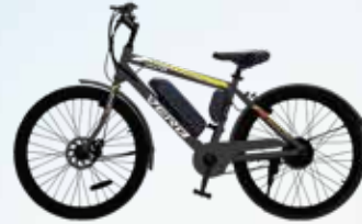
Model NO.: EB 28 AN75 Model NAME.: CREATION