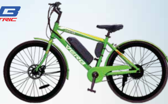
26"/BLDC 250W /36V/7.5 Ah Li-ion Battery / 45-50KM/C Steel Frame