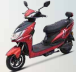
Model NO.: ES12BZ Model NAME.: ZOOM