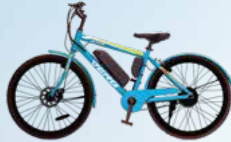
Model NO.: EB 28 AN75 Model NAME.: CREATION